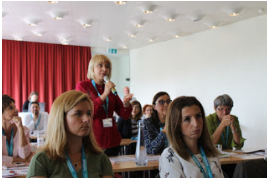
Posted by Syed Shoeb Ahmad

patients with a normal macrovascular endothelial function. The reduction in venous flicker-induced dilatation compared to dilatation in healthy individuals was associated with echographic evidence of left ventricular stiffness and pulmonary hypertension. An important cardiovascular risk factor, hypercholesterolemia, was also associated with a significant reduction of flicker-stimulated arteriolar dilatation. According to Nägele, retinal vascular analysis may be a useful tool for cardiologists to assess the success of vascular-targeted therapies in patients with heart failure.